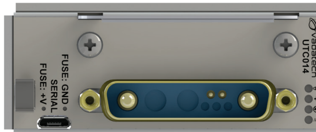
Figure 2: Front Panel