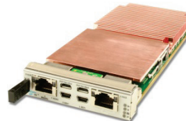
AMC720 Processor AMC