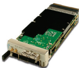
UTC004 Gen 3 MCH